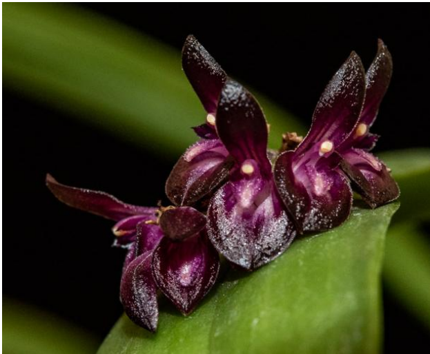
Acianthera sicaria 'Bryon Kelly Rinke' AM 80 pts. Exhibitor: Bryon Rinke