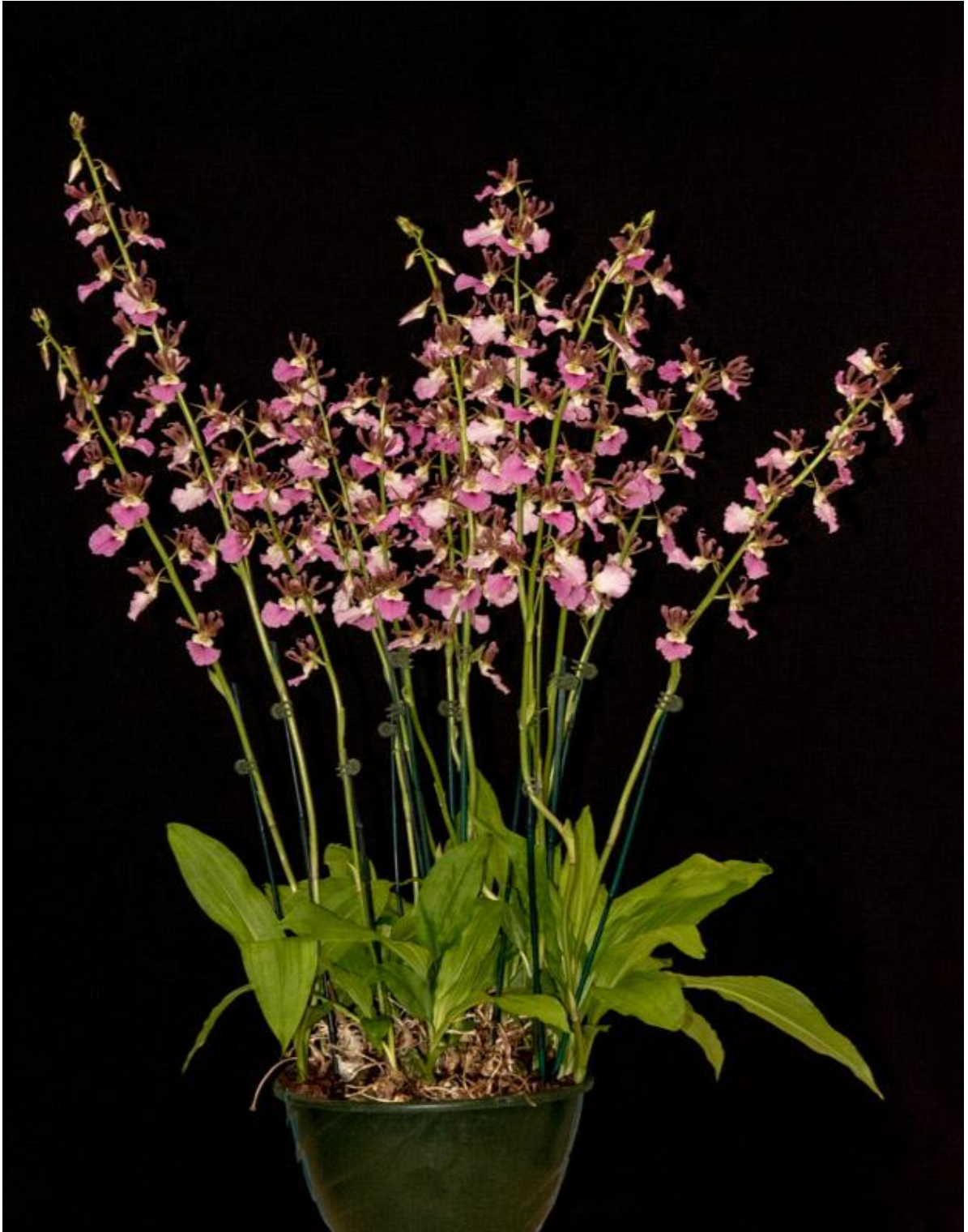
Eulophia guineensis 'Bryon' CCE 94 pts.

21 plants were evaluated and 6 awards given