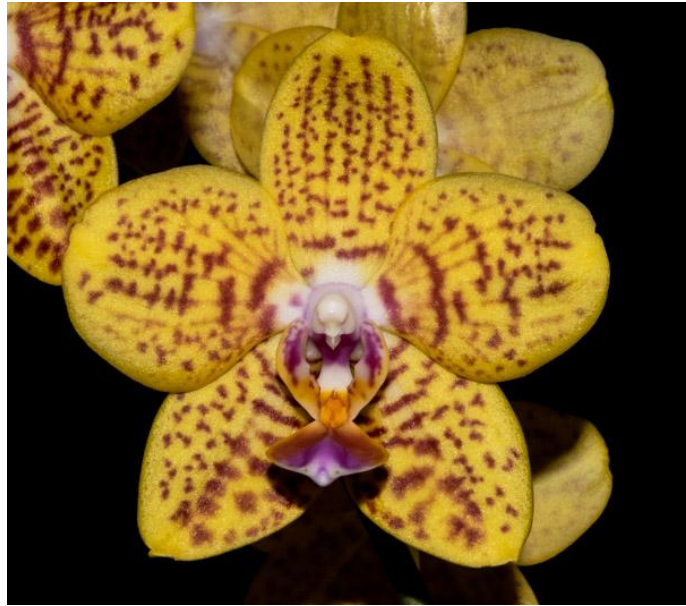
Phalaenopsis Walnut Valley Yellow Sun 'Bryon & Max' HCC 77 pts. Exhibitors: Bryon Rinke and Max Thompson