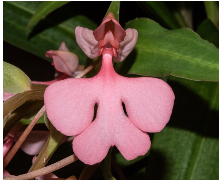
Habenaria rhodocheila 'Max & Bryon's Big Pink'