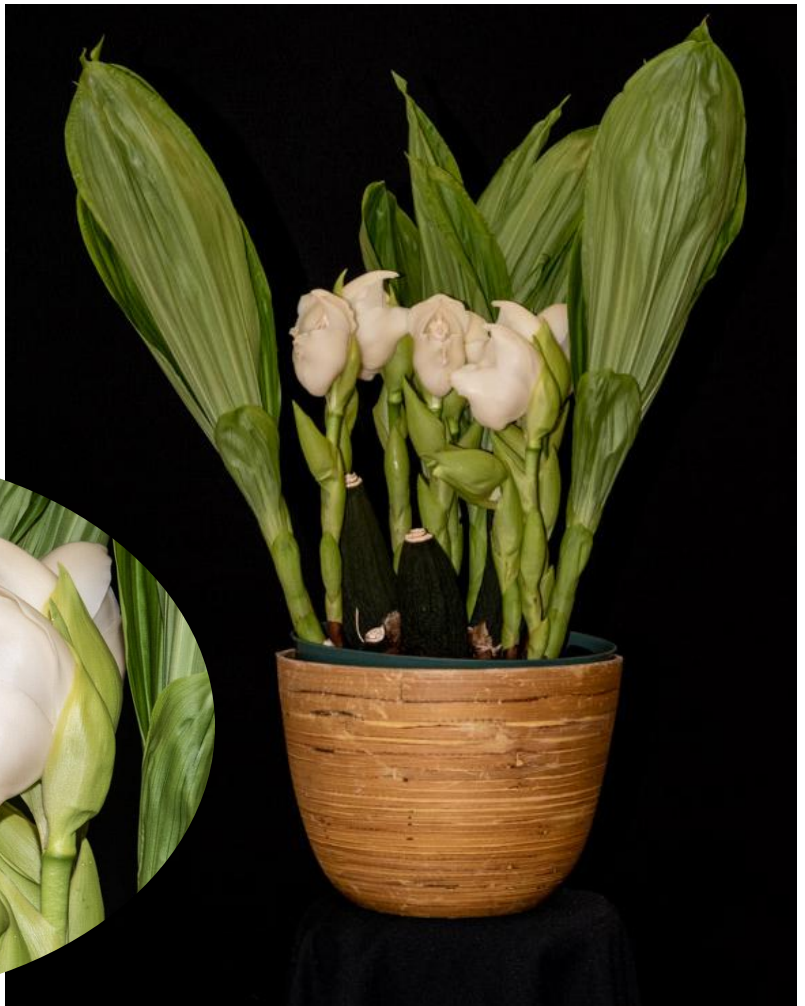
Anguloa ebernea 'Lisse' CCM/AOS 87 pts AM/AOS 86 pts. Exhibitor: Douglas Needham