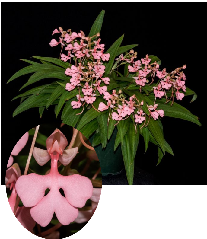
Habenaria rhodocheila ssp. rhodocheila