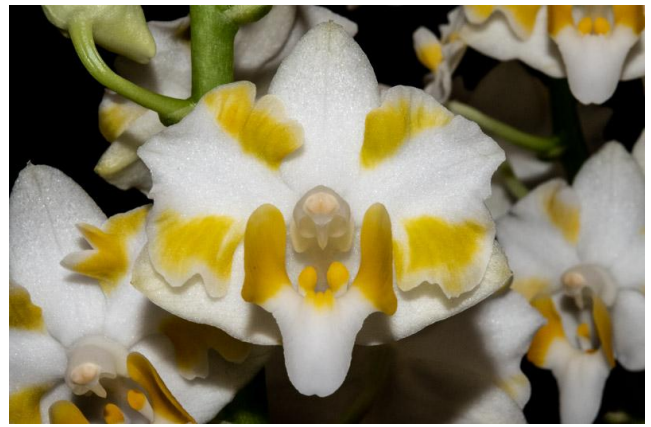
Phalaenopsis pulcherrima var. champorensis f. alba 'Bryon' HCC 78 pts.