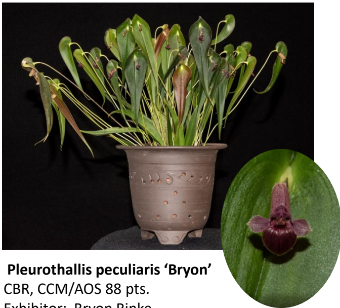
Pleurothallis peculiaris 'Bryon'